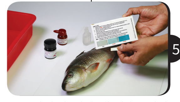
Compare the developed colour** with the standard colour chart provided on the box.