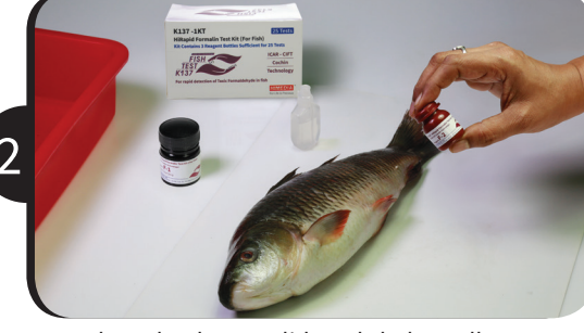
Replace the dropper lid, and shake well. (Imp. Reagent should be used within 20 days of preparation).