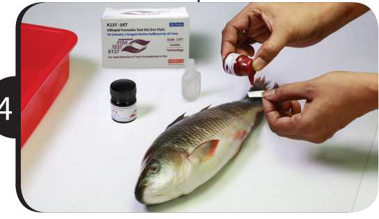
Add just one drop of Reagent F-2 on swabbed paper strip and wait for 1.5 to 2.0 minutes for maximum colour development.