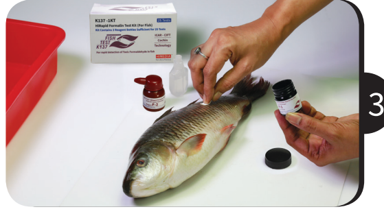
Take out a strip from Reagent bottle F-1 . Swab it on the fish surface/cut surface of fish* 3 to 4 times at different portions in order to wet the paper strip.