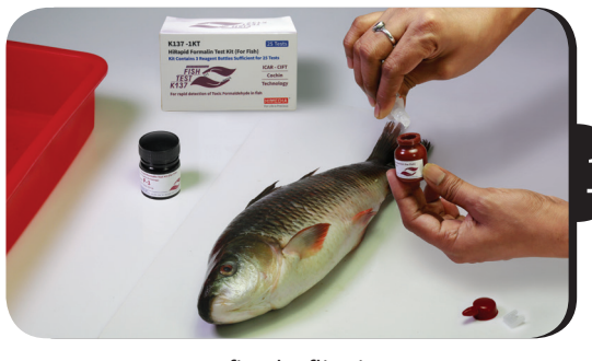
Prepare reagent F-2 first by flipping open the dropper lid from bottle F-2 , empty the contents of vial F-W in it.